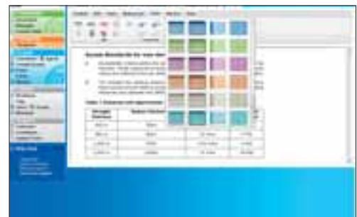
Dynamic content editing