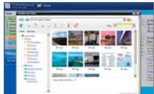
Asset management capabilities